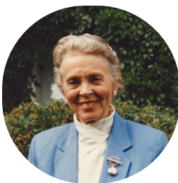
Gateway to Joy