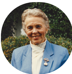
Gateway to Joy