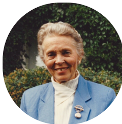
Gateway to Joy