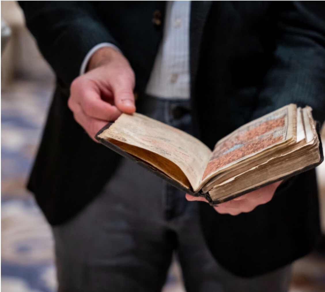
Jim Elliot's Bible, recently donated to The Museum of the Bible.

2025! We will share more info soon about our award-winning director and producer who will be developing the project. We will also be honoring the patrons who will be partnering with us to fund this work. To God alone be the glory!